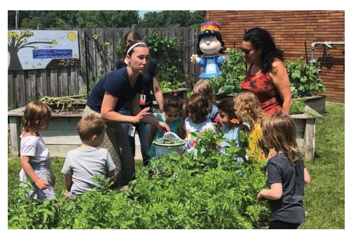
The Friendship Giving Garden, cared for in partnership with Benilde St. Margarets, provides our Aleph Preschool students hand on learning opportunities combined with opportunities for Tzedakah when the summer harvest is donated to STEP.