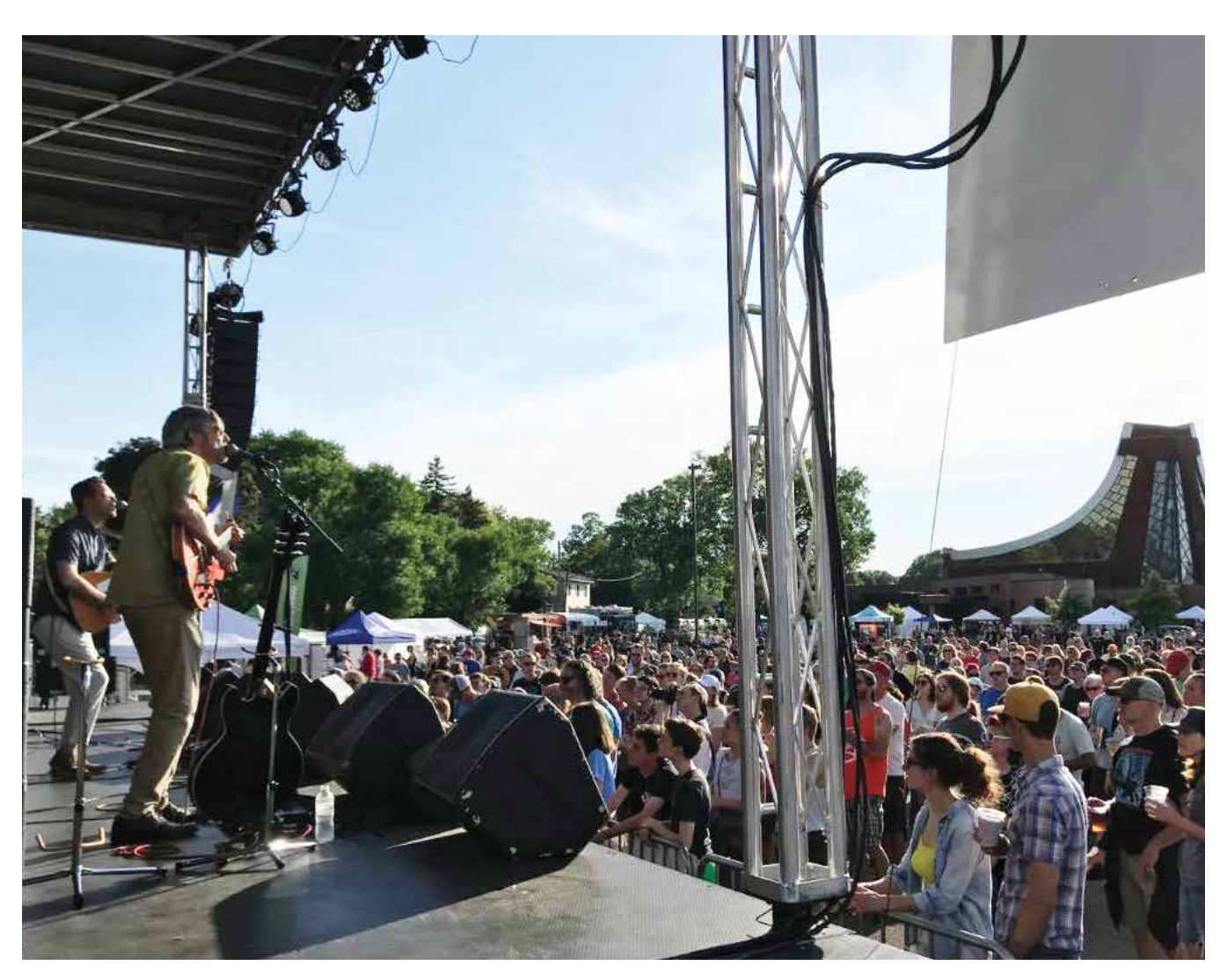
There was nothing but blue skies, great music and community at the 2019 Common Sound Music Festival!