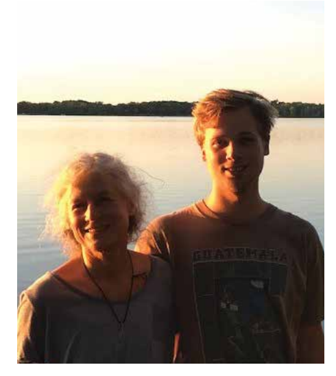
The Solomon Family