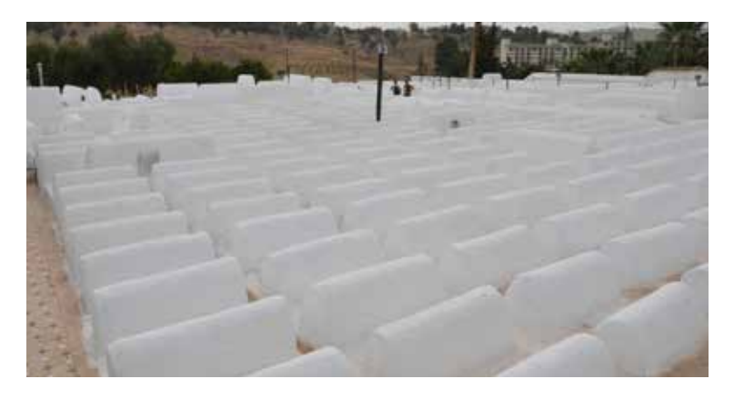
Jewish cemetery with unmarked graves of children who died during the Typhoid epidemic. Also buried here are some of the Jewish saints – people who were revered by the community. The cemeteries were restored and are maintained by the Muslim community as decreed by the King in their constitution.