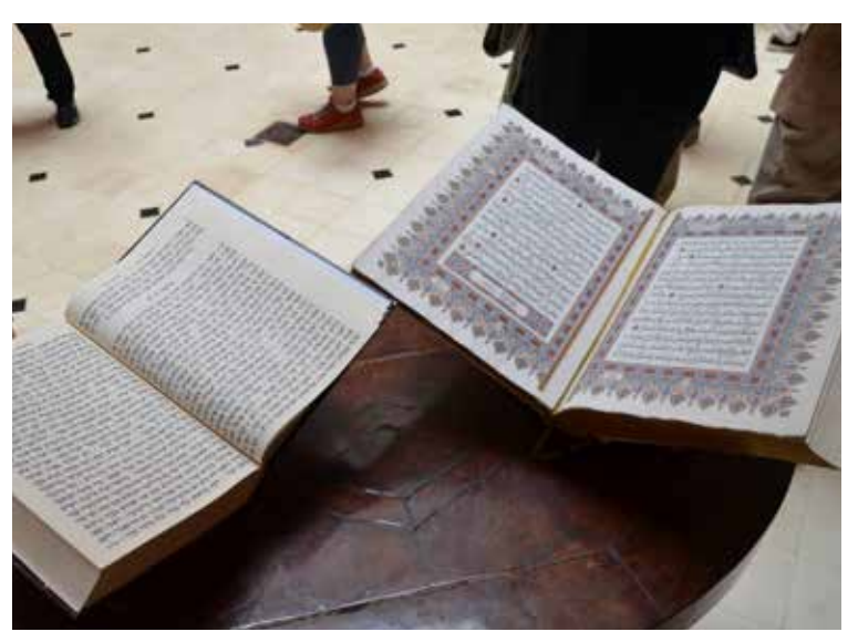
Chumash and Koran next to each other in the small museum/ synagogue in Essuouria. Both open to parashat Noah – what we were actually reading for that Shabbat. Dana Pepper read from the Chumash and the Muslim woman at the facility read from the Koran.