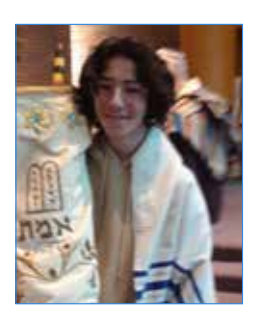
January 14, 2023 / 21 Tevet 5783 Shemot