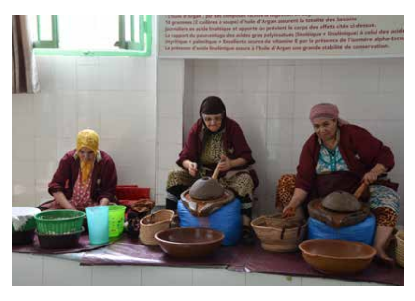
How Argon oil is extracted. This is a special women's cooperative benefiting the women who work there.