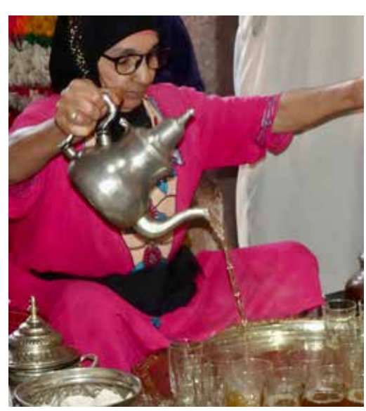
Traditional Berber tea ceremony in a traditional Berber home in the Ourika Valley.