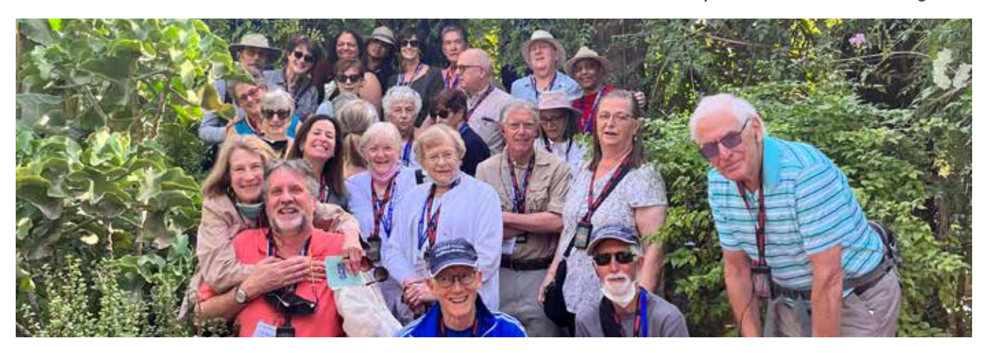
The gang in the beautiful Majorelle gardens in Marrakesh.