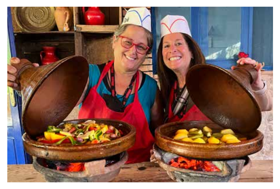
We went to a cooking school to learn how to make our own Tagines. Yum!